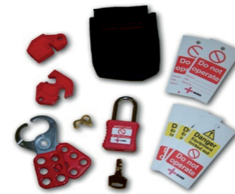
Safe isolation equipment

Make sure you measure the earth loop impedance of the power supply with the correct equipment.