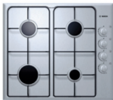
NGU4151DB - Bosch FD 8901 - 9110