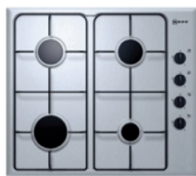
T20S31N0 - Neff FD 8901 - 9110

BSH Home Appliances Ltd (BSH) has initiated this precautionary measure because, during comprehensive product monitoring and detailed research, BSH identified a potential issue regarding the gas connectors. In specific circumstances, the gas connector can crack or break, which could result in an escape of gas.